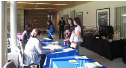
Resource fair demonstrated partner organizations are ready to support families