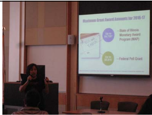
Financial aid information