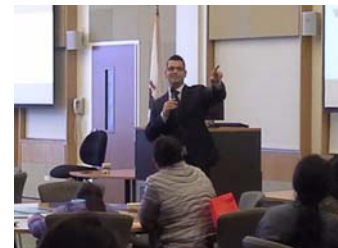
Latino professionals as speakers