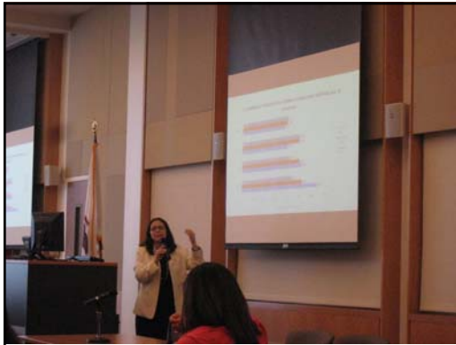
Education & employment data as context to empower families