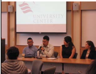
First generation college student panel